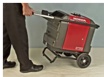
2 or 4 Wheel Kit