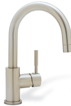
Model 440954 shown