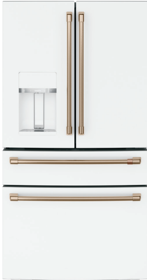
CVE28DP4NW2 Matte White with Brushed Bronze handles