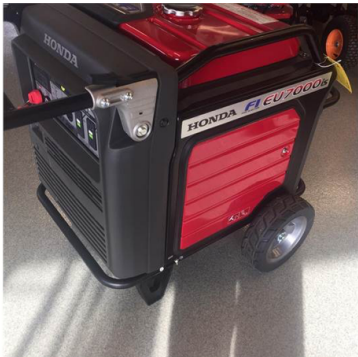
Honda Power Equipment EU7000IAG